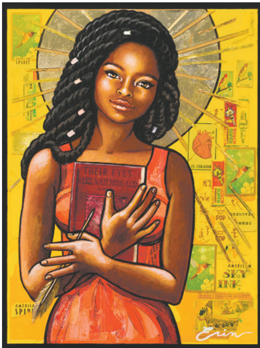
A portrait of poet Amanda Gorman

Since he’s been gone, I’ve continued to live fully and brightly the life we built